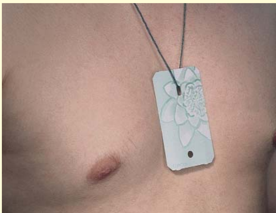
The SI CARD – effective adjuvant therapy

Electroacupuncture with the VEGATEST offers a broad spectrum of diagnostic possibilities. Two examples from my own daily work with the VEGATEST should make clear how profound the insights are into the organism that the VEGATEST allows. The