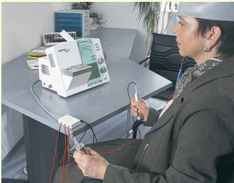
Energy Screening with the VEGATESTexpert

But the VEGATEST expert offers even more functions that have caused a sensation in expert circles: diagnosis and therapy with the VEGATEST expert begins with Energy Screening, an overview measurement that, within minutes, provides information about the patient's energetic condition, regulatory capability and possible foci and disturbance fields in the body. In this process, seven body segments are measured in two measurement cycles; disturbance fields and energy blocks are located and the organism's regulatory capability is checked.